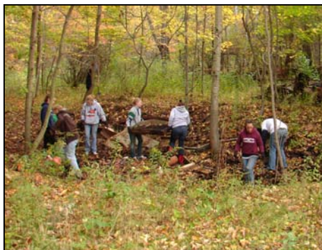
Pictured at left: Allegheny College students clean up debris on Shadeland Road property located in Cussewago Township

To say the least, the landowners were ecstatic with the results. A huge thank you goes out to all of the volunteers and to the United Way for organizing this much needed site cleanup.